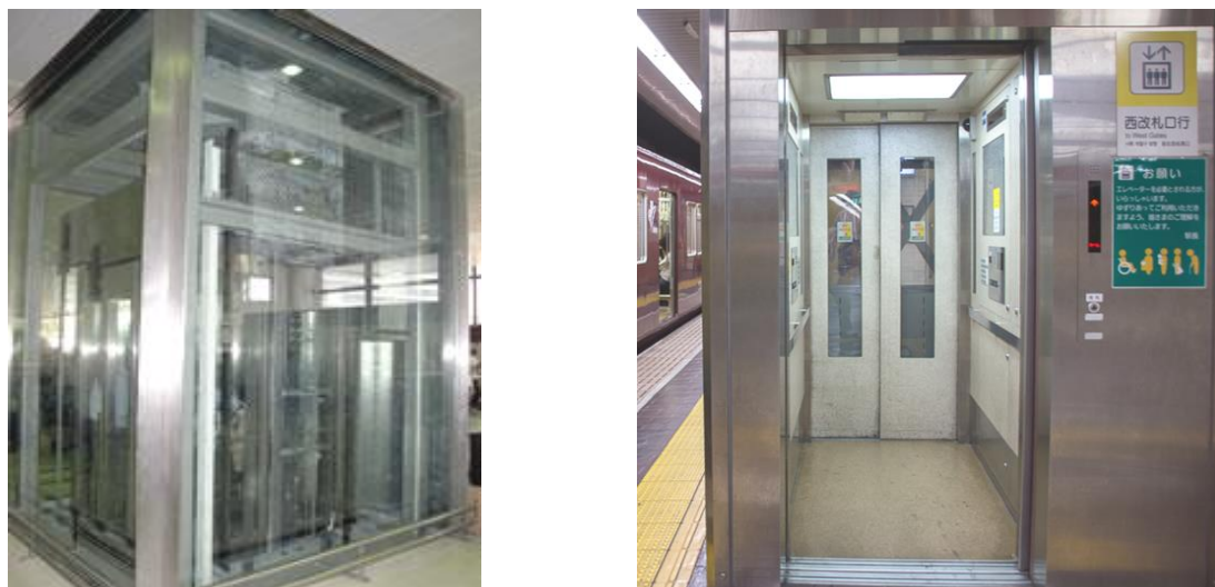
Figure 2 - Elevators for people with limited mobility

Also, various devices are used for the free movement of passengers between levels: lifts (Figure 3, a), escalators (Fig. 3, b), for horizontal movement – travelators (Figure 3, c).