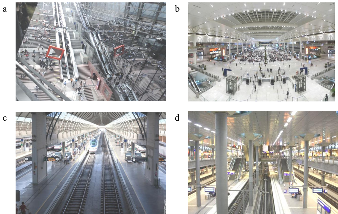
a – Kyoto (Japan), b – Shanghai (China), c – Seville (Spain), d – Berlin (Germany).

Elevators are used for accessibility of platforms for low-mobility groups of the population (Figure 2).