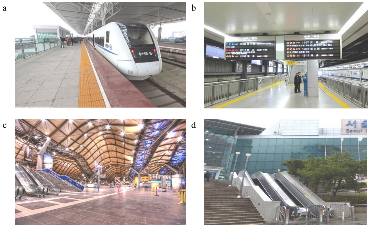
a – platform (China), b – platform (Japan), c – railway station (South Korea), d – station area (South Korea)